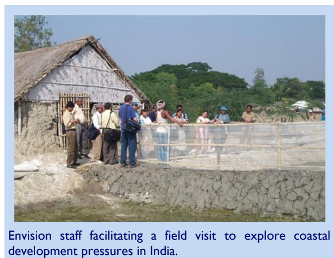
Envision staff facilitating a field visit to explore coastal development pressures in India.

Developing training capacity in India: Envision Staff implemented a DfID funded project to support ICM Training at two Indian Universities: Anna University, Tamil Nadu and Jadavpur University, West Bengal to sustainably establish: