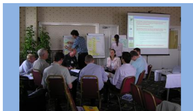
Facilitated discussion on coastal planning with local authority planners and line agencies as part of a COREPOINT School of Excellence in ICZM.

Designing Schools of Excellence in coastal management in NW Europe: Funded under the INTERREG IIIB programme, the COastal REsearch and POLicy INTegration (COREPOINT) project assessed progress the development and implementation of Integrated Coastal Zone Management (ICZM) solutions. Envision developed “Schools of Excellence” in ICZM for local practitioners and implemented them in 4 countries. The schools developed a mixture of expert-led presentations, case studies and working exercises. Other activities in this project involved working with local partners and stakeholders involved in coastal management activities to carry out an ICZM review and a stocktake of NE England with a view to building new approaches to coastal planning and development.